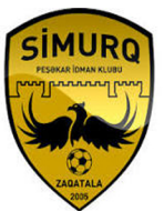
FK Simurq Zaqatala