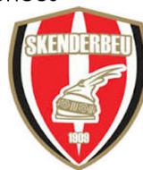
KF Skënderbeu Korçë