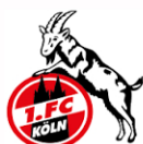
1. FC Köln